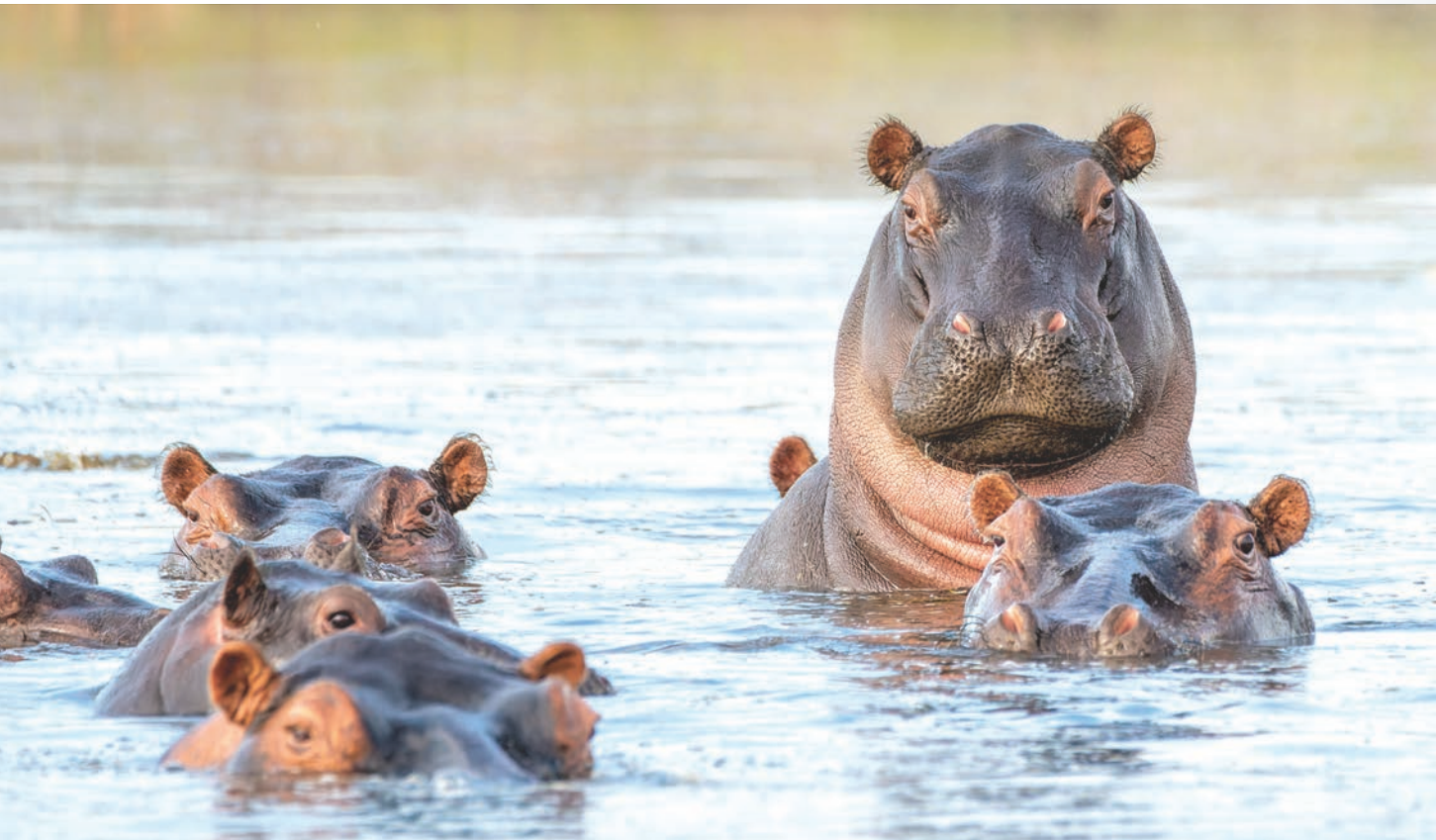
(Left to right) Hippos in Chobe National Park; a lion in Botswana

Search AFOE30 at aptouring.com.au From $56,895 per person, twin share.* Departing April 2026 to September 2027. * Conditions apply – see page 35