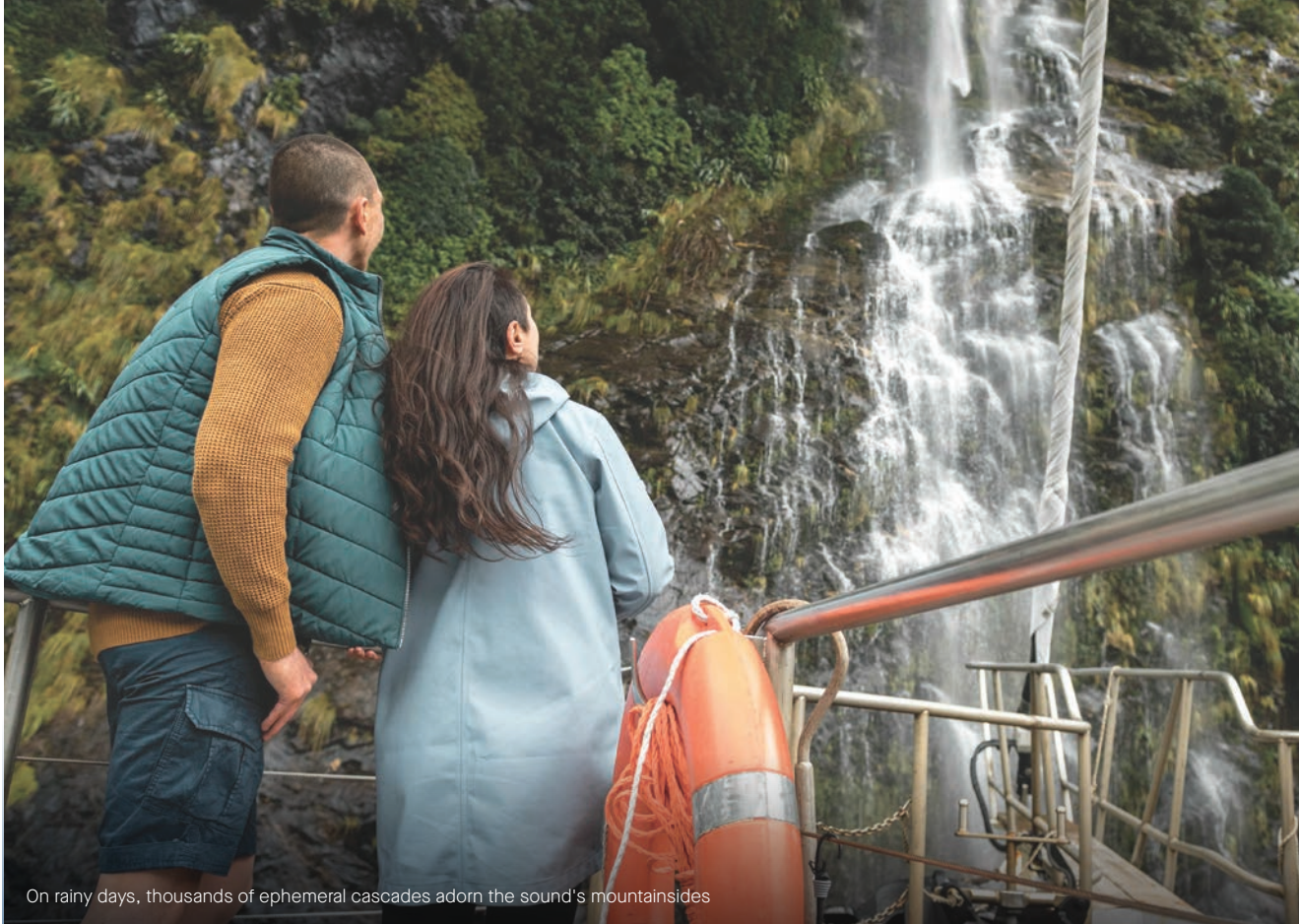
On rainy days, thousands of ephemeral cascades adorn the sound's mountainsides

and spacious viewing decks. Inviting shared spaces frame views that need no embellishment, offering a sense of comfort that complements, rather than competes with, the grandeur outside.