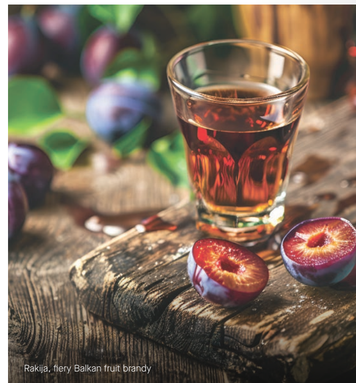
Rakija, fiery Balkan fruit brandy