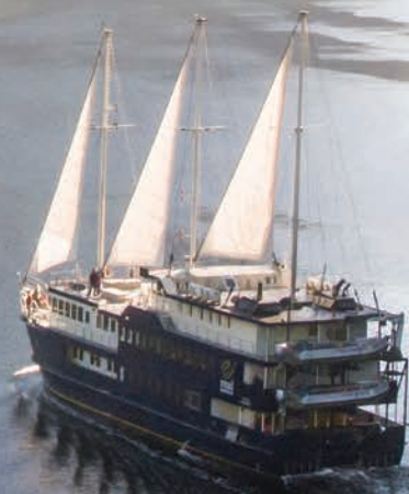
The Fiordland Navigator sailing on Doubtful Sound/Patea