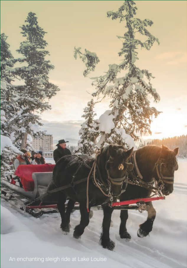
An enchanting sleigh ride at Lake Louise

Inside the grand hotel, the scene is equally enchanting. At the intimate Walliser Stube restaurant, fondue bubbles in cast iron pots. Fires crackle during cocktail hour in the Lakeview Lounge, and après-ski classics are shared over stories at Alpine Social. From your Lakeview Room, delight in views of the mountains framing the lake’s frozen surface, and sunlight dancing across icicles like scattered stars.