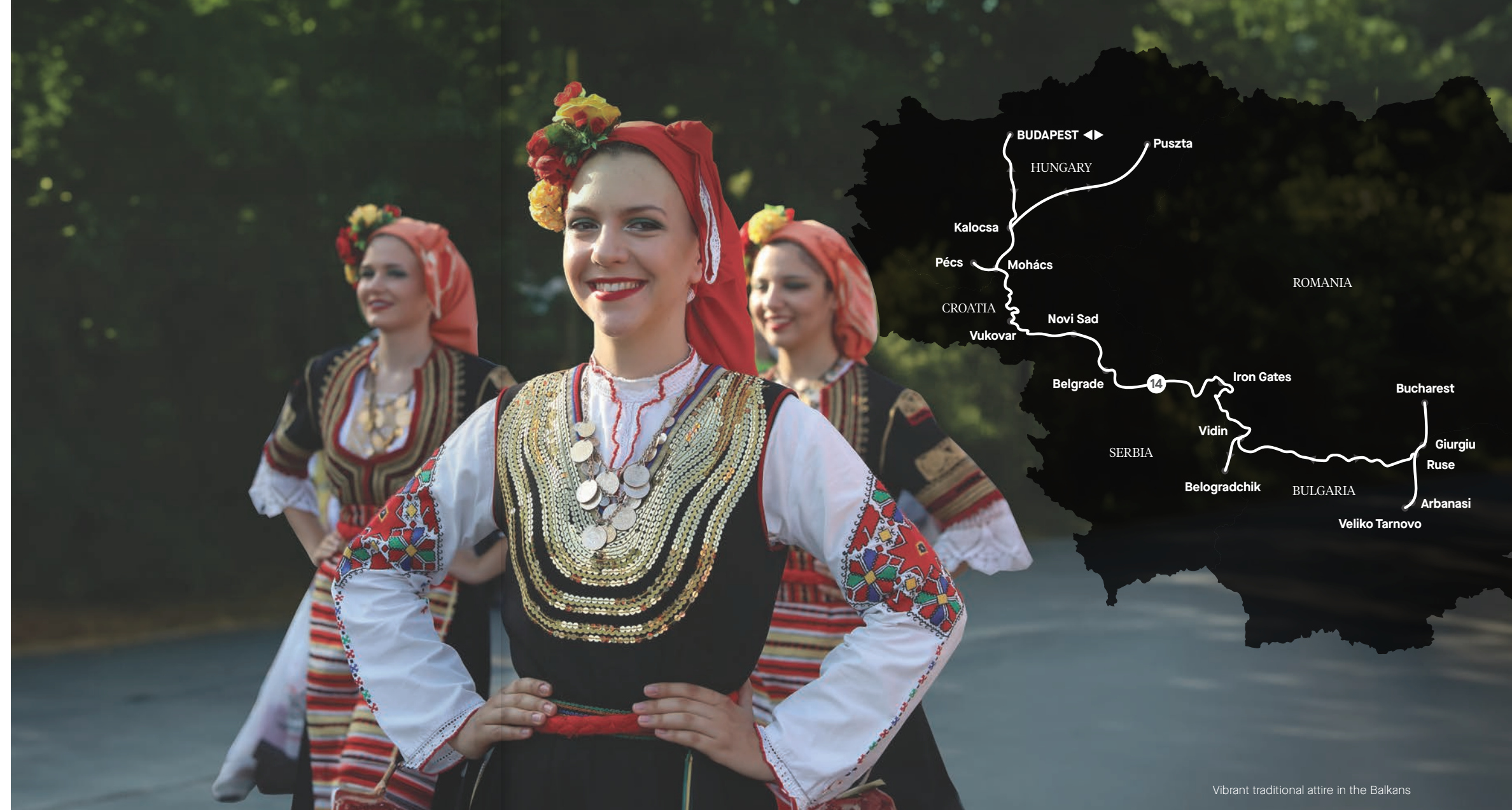
Vibrant traditional attire in the Balkans

The Balkans boast some of Europe's quirkiest borders — think enclaves, exclaves, and even a tripoint where Serbia, Croatia, and Hungary converge. These complex lines tell tales of empires, wars, and shifting identities, making the map as fascinating as the terrain itself.