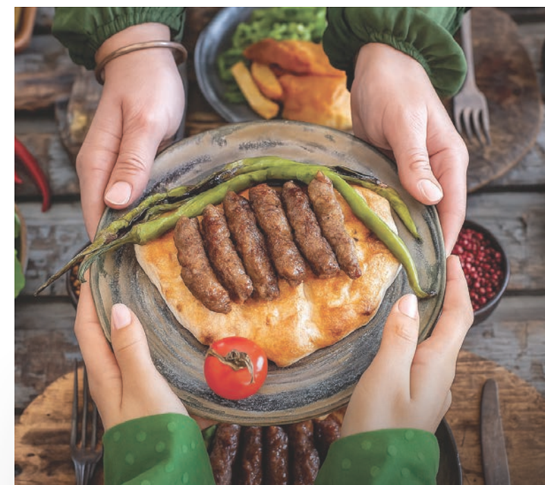
(Top to bottom) The gorges of the Danube form a natural border between Romania and Serbia; authentic comfort food

A voyage through the Balkans is more than a passage along the Danube — it's a step into living history, where ancient rivers whisper of empires past, fortresses rise in silent command, and traditions linger in every taste, every stone, and every tale shared along the way.