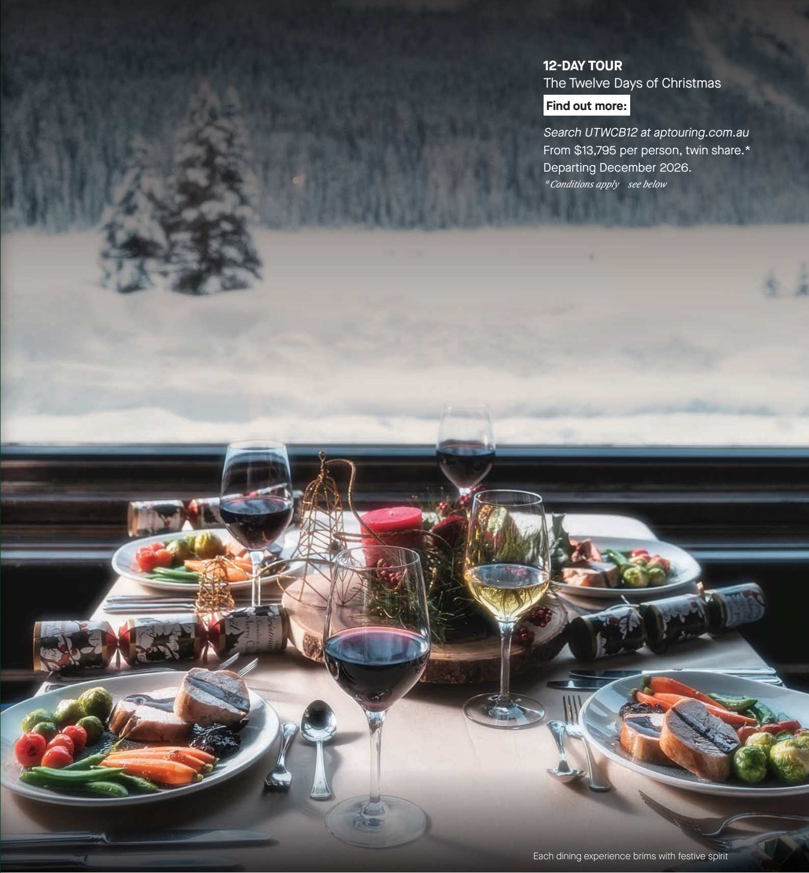
Each dining experience brims with festive spirit

In Mount Stephen Hall, a 20-foot Christmas tree stands resplendent, its ornaments shimmering beneath dazzling chandeliers. On Christmas Day, enjoy a host of optional indulgences. Sip festive cocktails at the Thirsty Reindeer bar or curl up in a fireside nook with a glass of Okanagan red. Savour meals to remember from a festive afternoon tea in the Rundle Bar to brunch in the Riverview Lounge and a Christmas feast with all the trimmings — golden roast turkey, gammon, crispy potatoes, gravy and honey roasted parsnips. Here, amid alpine grandeur and pristine snow, a magical Christmas awaits, and it’s one that will linger long after the season fades.