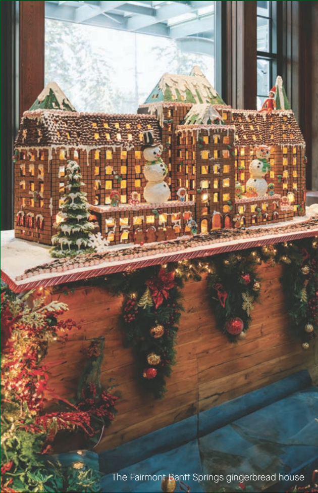
The Fairmont Banff Springs gingerbread house

The road into Banff winds between peaks so dramatic they seem brushed onto the sky. Through the trees, Fairmont Banff Springs emerges, rising from the forest like a castle lifted from the pages of a novel. Built in the 19th century and inspired by the romance of Scottish baronial architecture and the chateaus of the Loire Valley, the hotel’s turrets and stone façades stand proud against the mountains. Mist curls above the rooftops, not fog, but steam from the outdoor thermal pool, still inviting even in the depths of winter. Inside, oak beamed ceilings soar like vaulted wings. Plush carpets hush your footsteps, and regal staircases sweep upward beneath garlands of pine and golden lights.