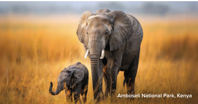
Amboseli National Park, Kenya

For a detailed day-by-day itinerary, up-to-date prices, savings and departure dates, search AFTKT14 on travelmarvel.com.au