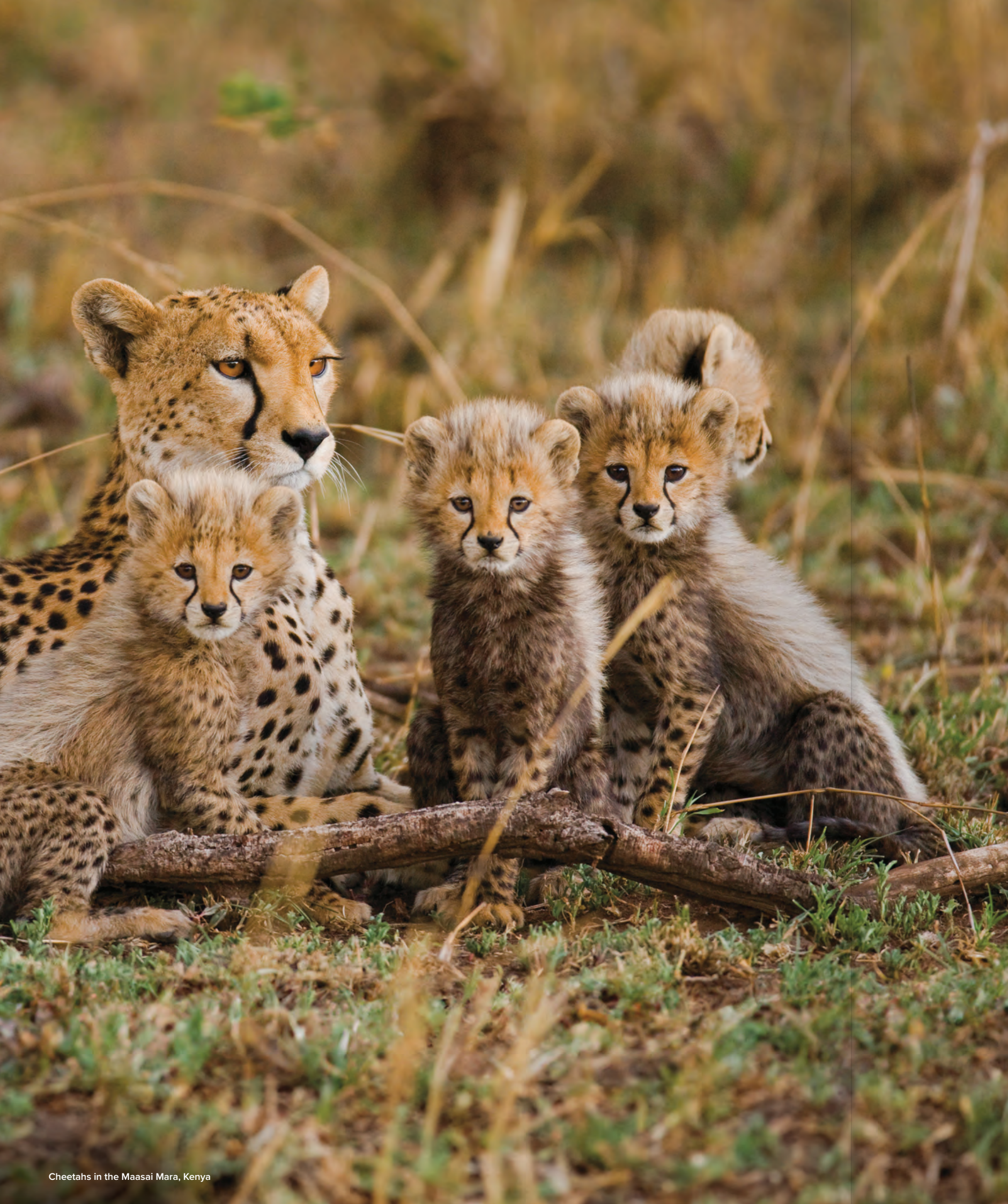
Cheetahs in the Maasai Mara, Kenya