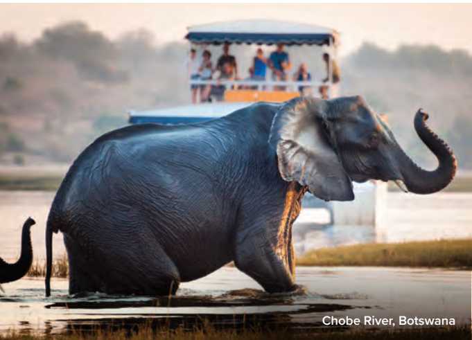
Chobe River, Botswana

Enjoy delicious dining on your houseboat. House wines, beers, soft drinks and mineral water are also all included. Early morning coffee can also be arranged.