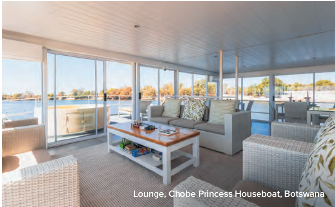
Lounge, Chobe Princess Houseboat, Botswana