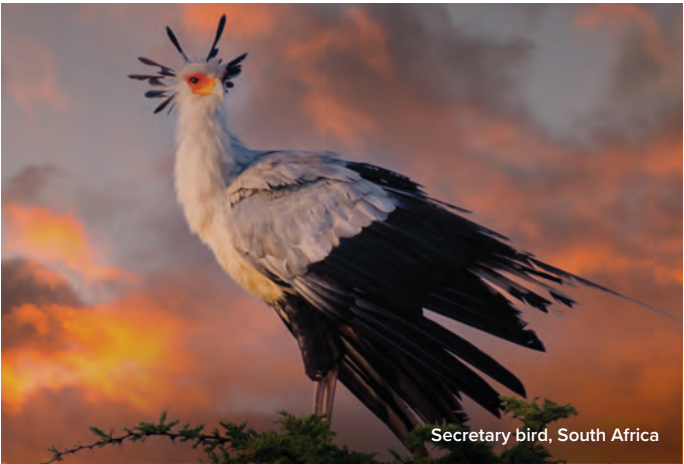
Secretary bird, South Africa

For a detailed day-by-day itinerary, up-to-date prices, savings and departure dates, search AFT15 on travelmarvel.com .au