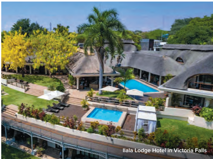
Ilala Lodge Hotel in Victoria Falls