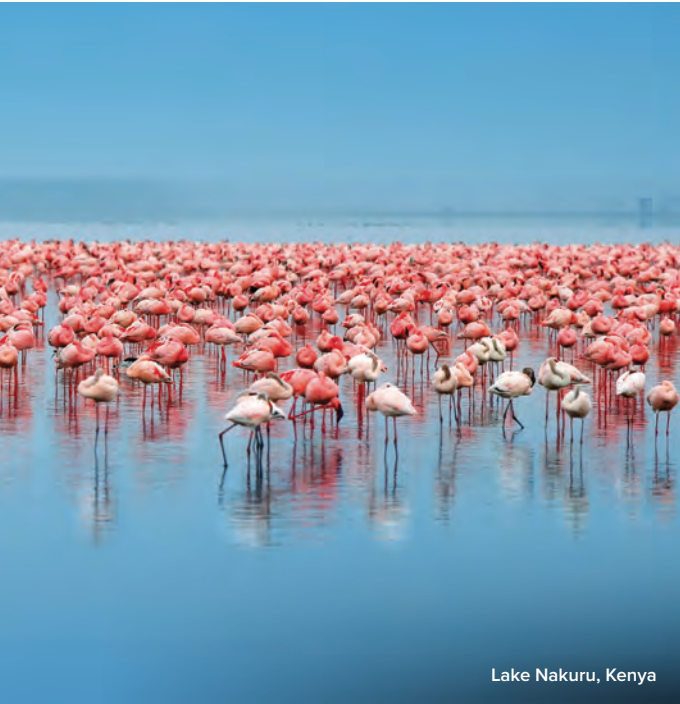
Lake Nakuru, Kenya

Your spectacular journey through Southern and East Africa draws to an end today. After a final breakfast on tour, transfer to Kilimanjaro International Airport for your onward flight. B