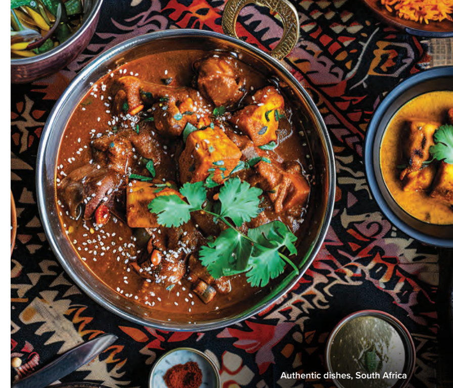
Authentic dishes, South Africa