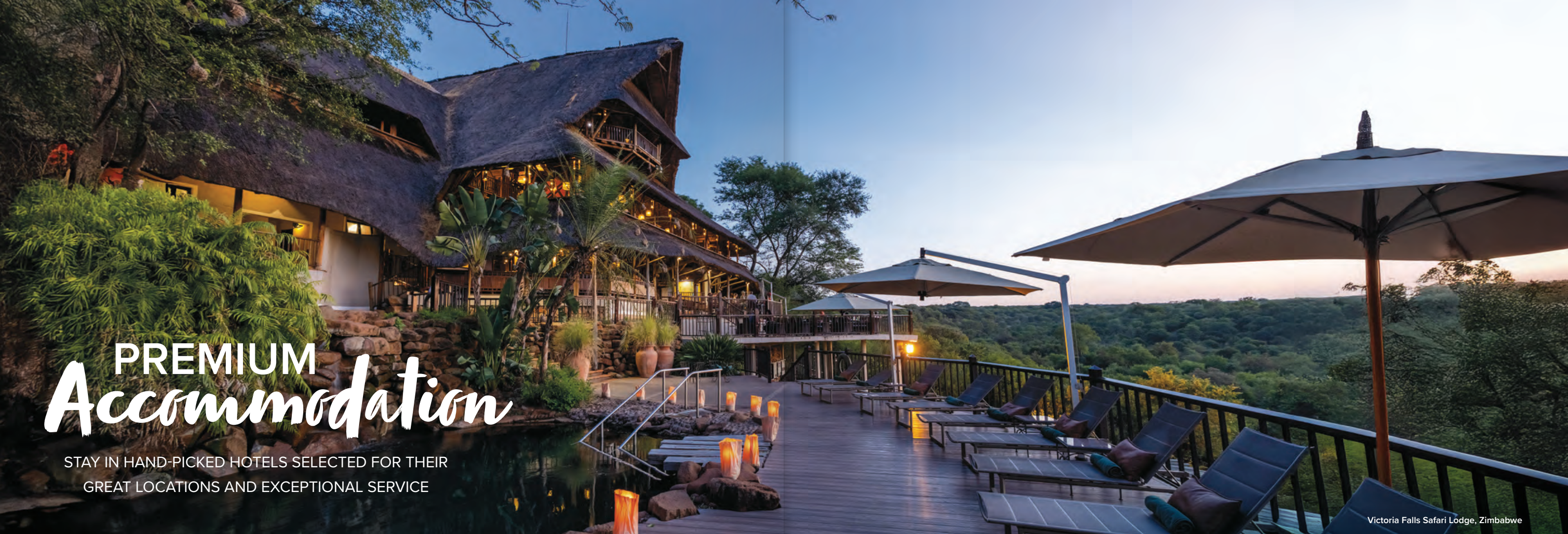
Victoria Falls Safari Lodge, Zimbabwe

STAY IN HAND-PICKED HOTELS SELECTED FOR THEIR GREAT LOCATIONS AND EXCEPTIONAL SERVICE