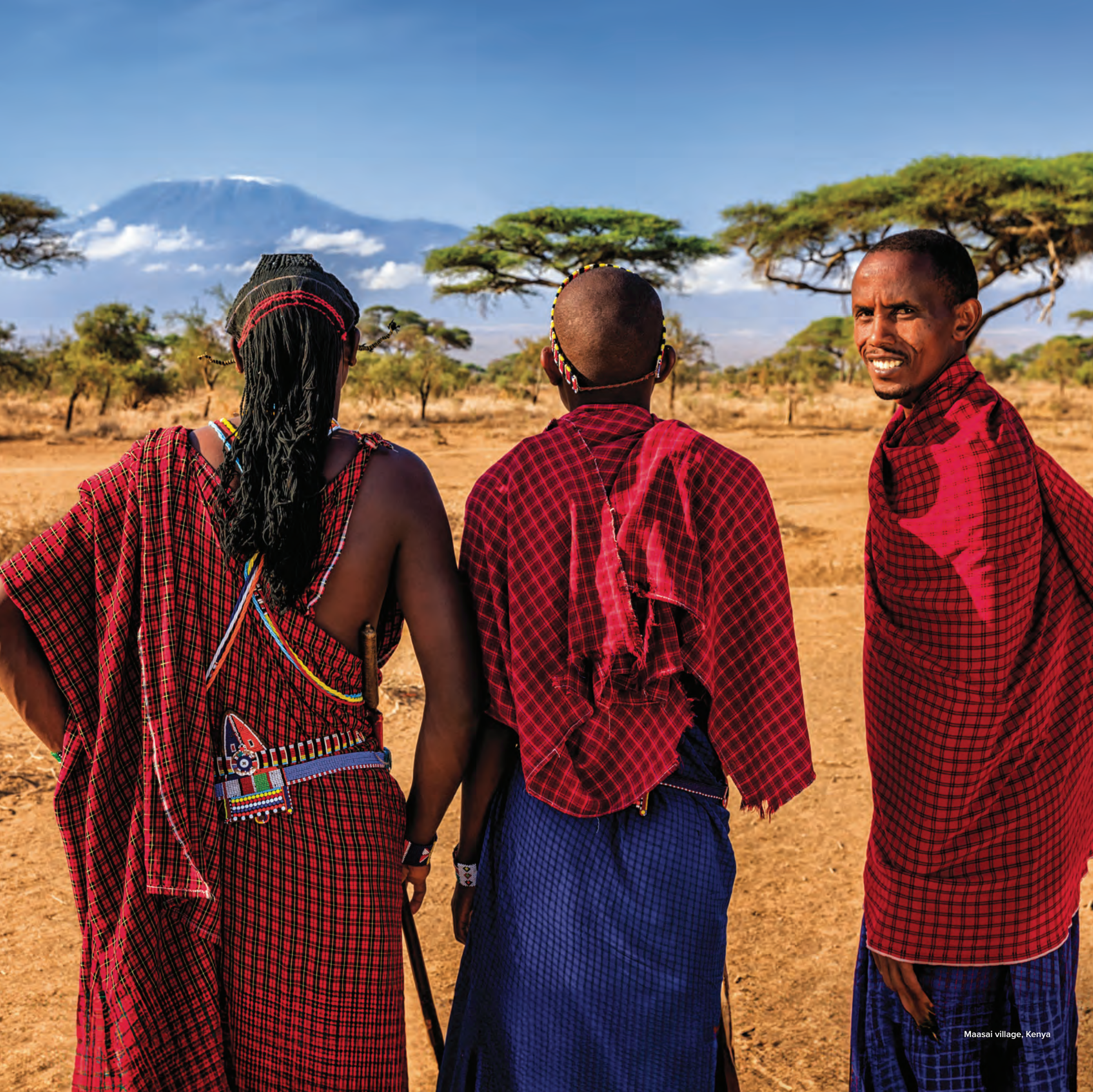
Maasai village, Kenya