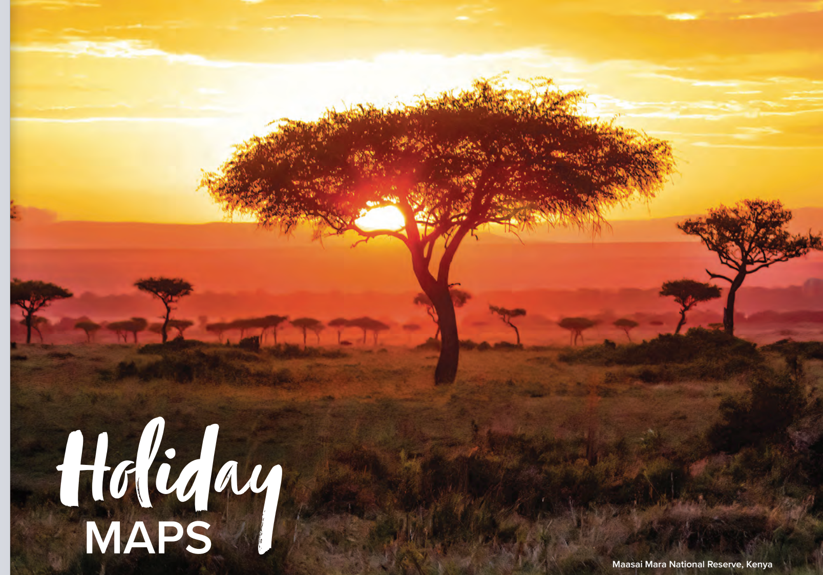
Maasai Mara National Reserve, Kenya

Join for free, visit travellmarvel.com.au/club