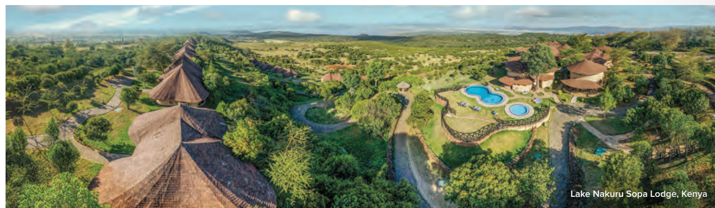
Lake Nakuru Sopa Lodge, Kenya

With Travelmarvel, where you stay offers more than just a place to rest your head. Unwind in carefully chosen lodges and camps that offer greater insight into each destination, while also providing unmatched comfort, style and quality.