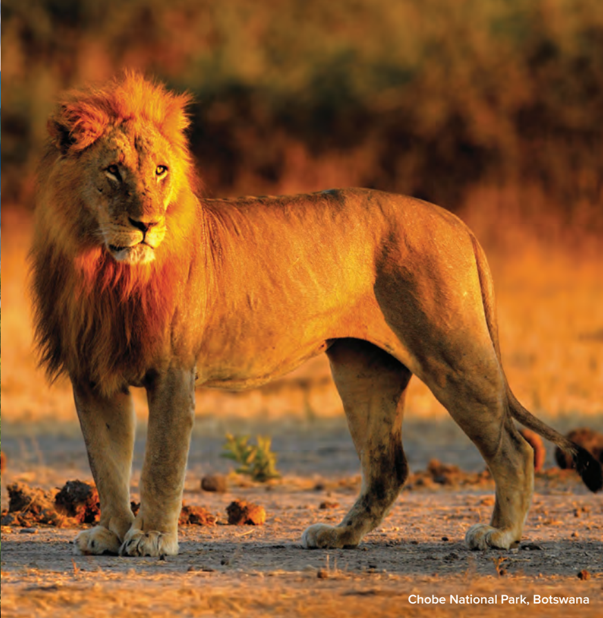
Chobe National Park, Botswana

about the dried-mud huts that the Maasai have built with their own hands, and interact with the villagers to learn about their daily life. You'll be awed by their intricate beaded jewellery and colourful crafts. This afternoon, there will be time to relax in the surrounds of your lodge and take a dip in the pool. Later, your Tour Director will be on hand to give an informative talk about the beautiful country of Kenya. Afterwards, indulge in a delicious meal for dinner. BLD