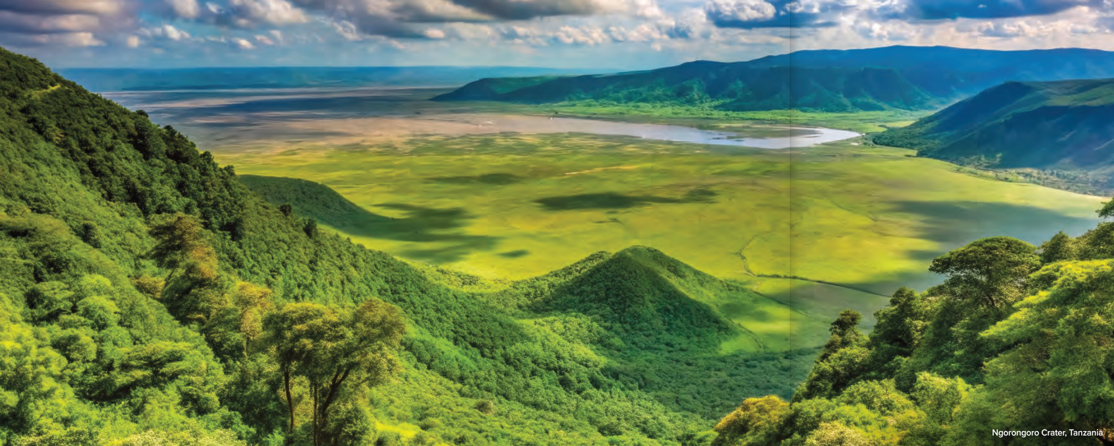
Ngorongoro Crater, Tanzania