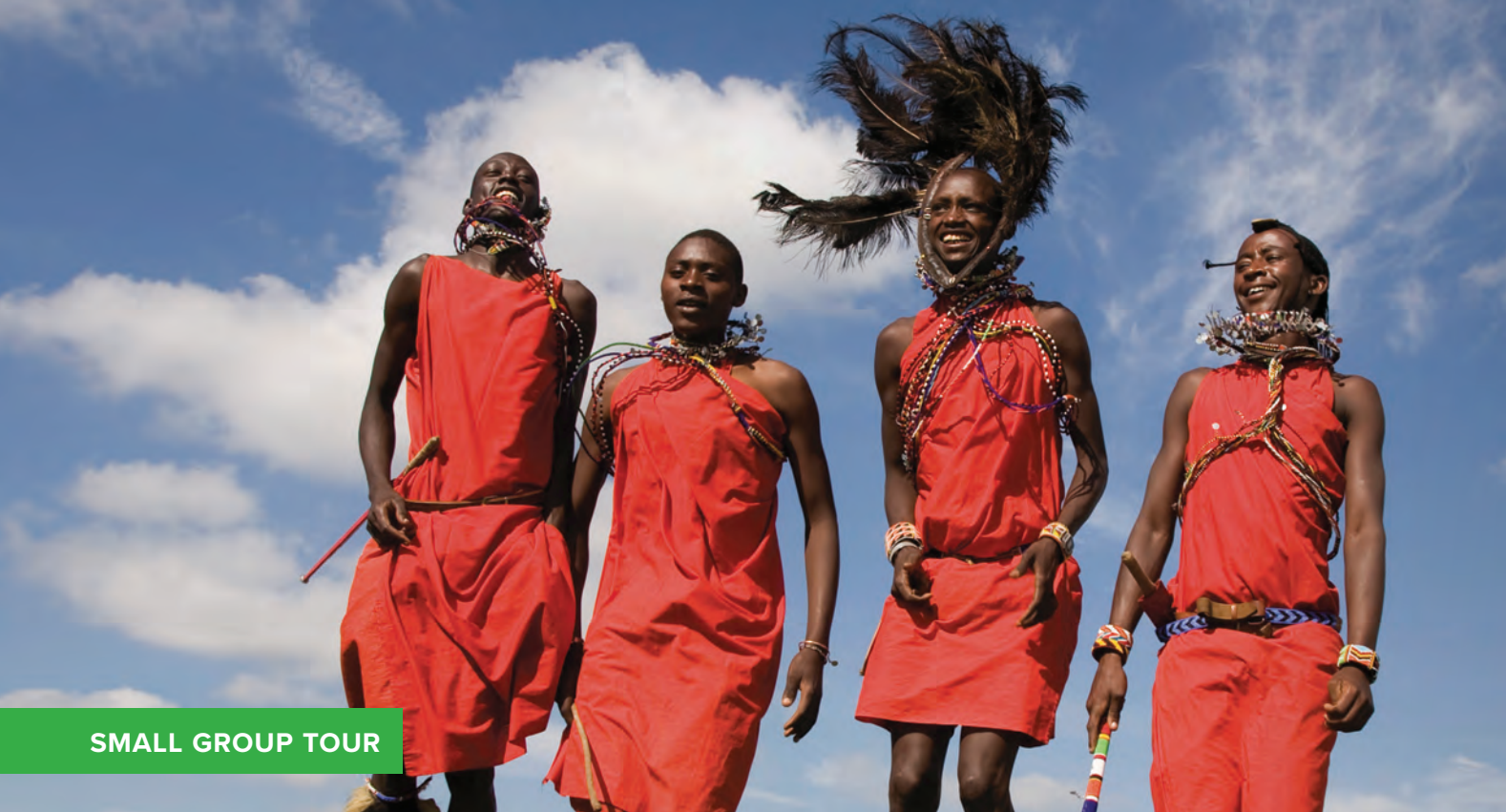
SMALL GROUP TOUR