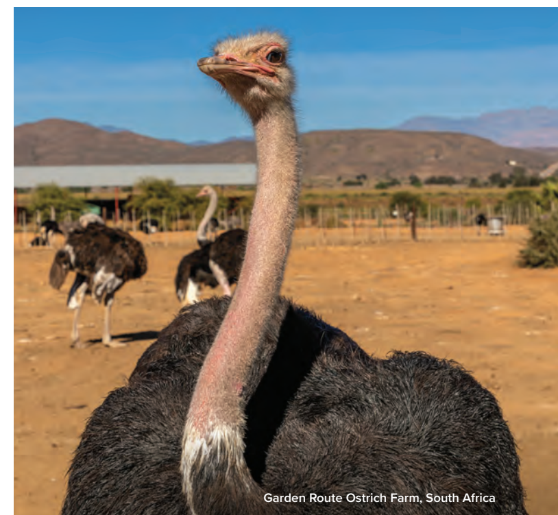
Garden Route Ostrich Farm, South Africa

Your Travelmarvel holiday covers the must-see sights, and also offers you a window into the lesser-known delights in each incredible destination with our specially selected Insider Experiences.