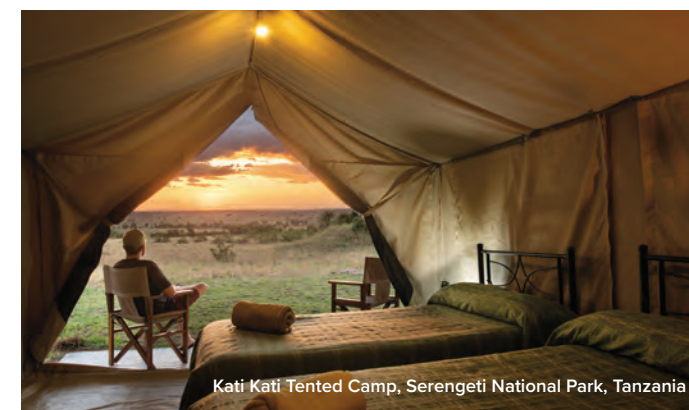
Kati Kati Tented Camp, Serengeti National Park, Tanzania

Situated on a spectacular range of hills that forms the western limits of Africa's Great Rift Valley, enjoy the beautiful surrounds and views of Lake Nakuru. Following a day of sightseeing, retire