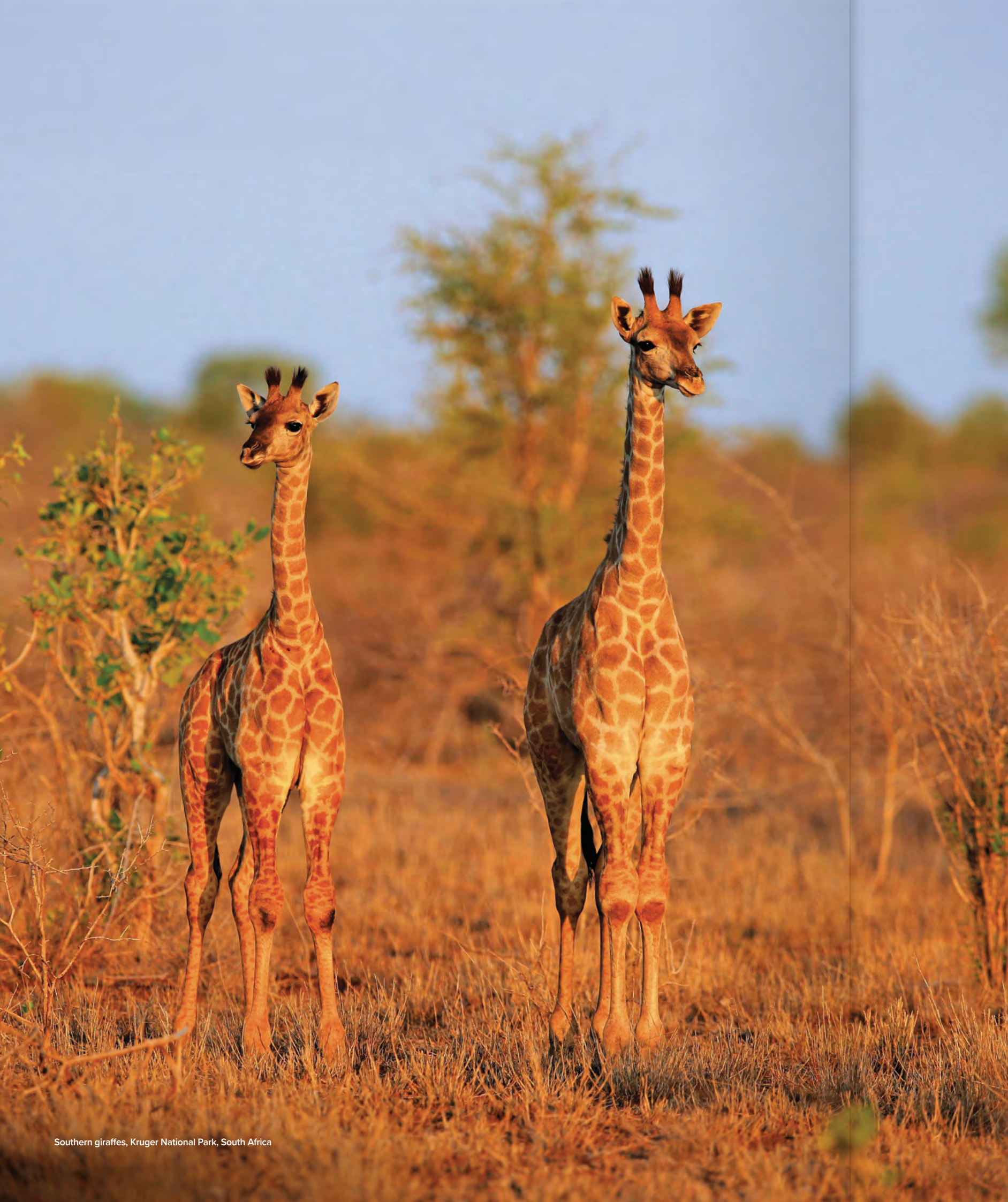
Southern giraffes, Kruger National Park, South Africa