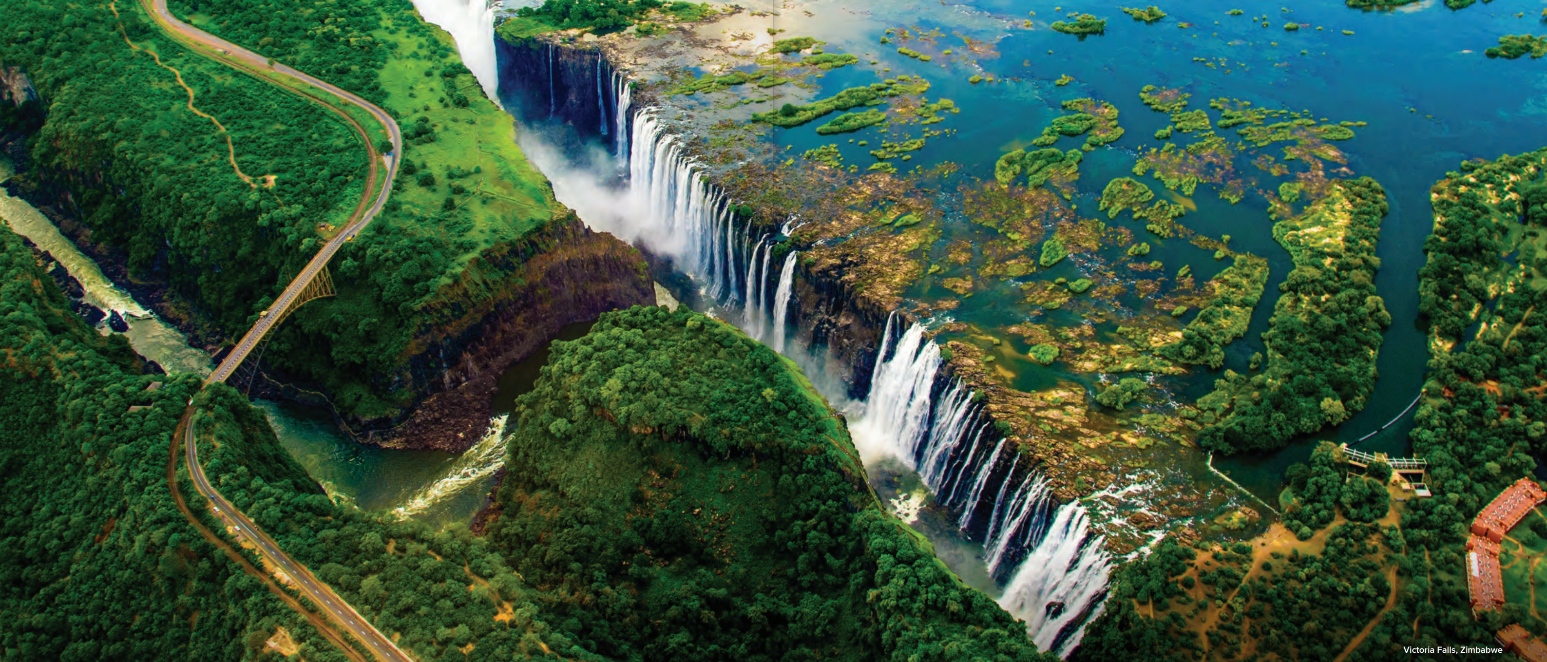
Victoria Falls, Zimbabwe