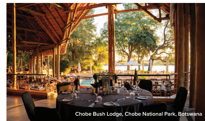
Chobe Bush Lodge, Chobe National Park, Botswana

to the comfort of the lodge. Enjoy a swim in the infinity pool overlooking Lake Nakuru, order a refreshing drink from the pool bar, or enjoy a meal on the breezy outdoor terrace.