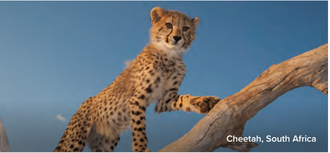
Cheetah, South Africa

Set off on a sensational Land Tour to the icons of Africa, uncovering the continent's highlights in spacious vehicles, with flights included. Discover diverse wonders throughout your journey, from game drives in South Africa to exploring world-famous national parks in Botswana, and admiring Victoria Falls in Zimbabwe. Plus, be escorted by Travelmarvel Tour Directors, local guides and expert game trackers every step of the way.