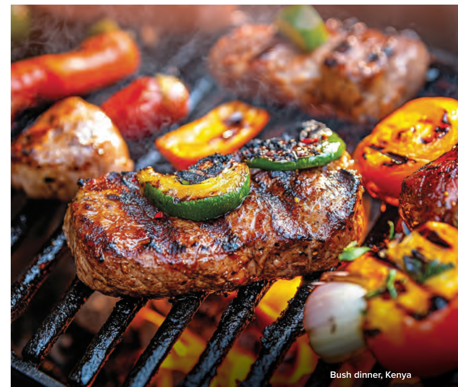
Bush dinner, Kenya

Meals are often a defining aspect of holidays, and great cuisine is an integral part of every destination. Each day of your itinerary is guaranteed to offer delicious flavours and memorable dining experiences.