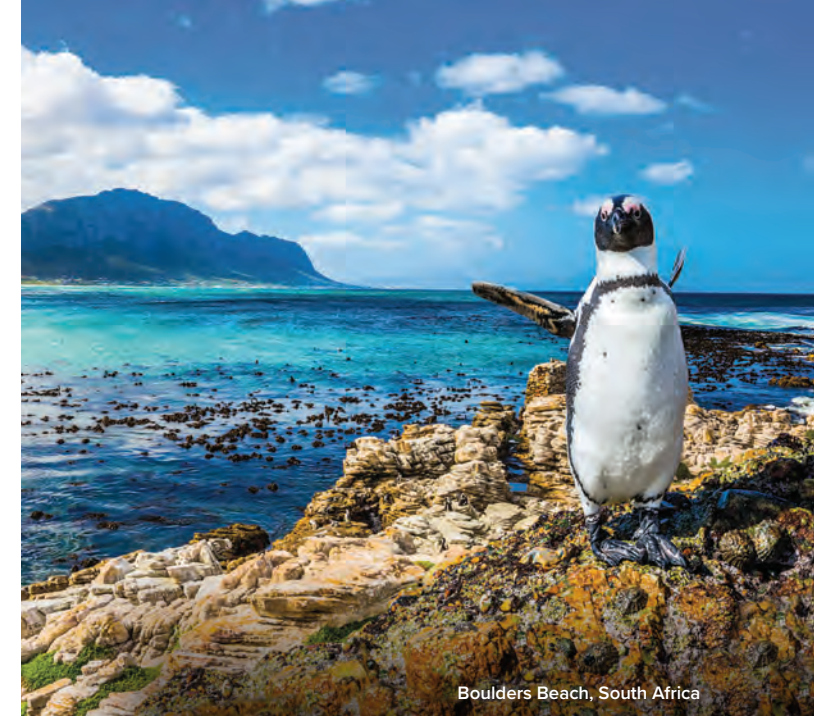
Boulders Beach, South Africa