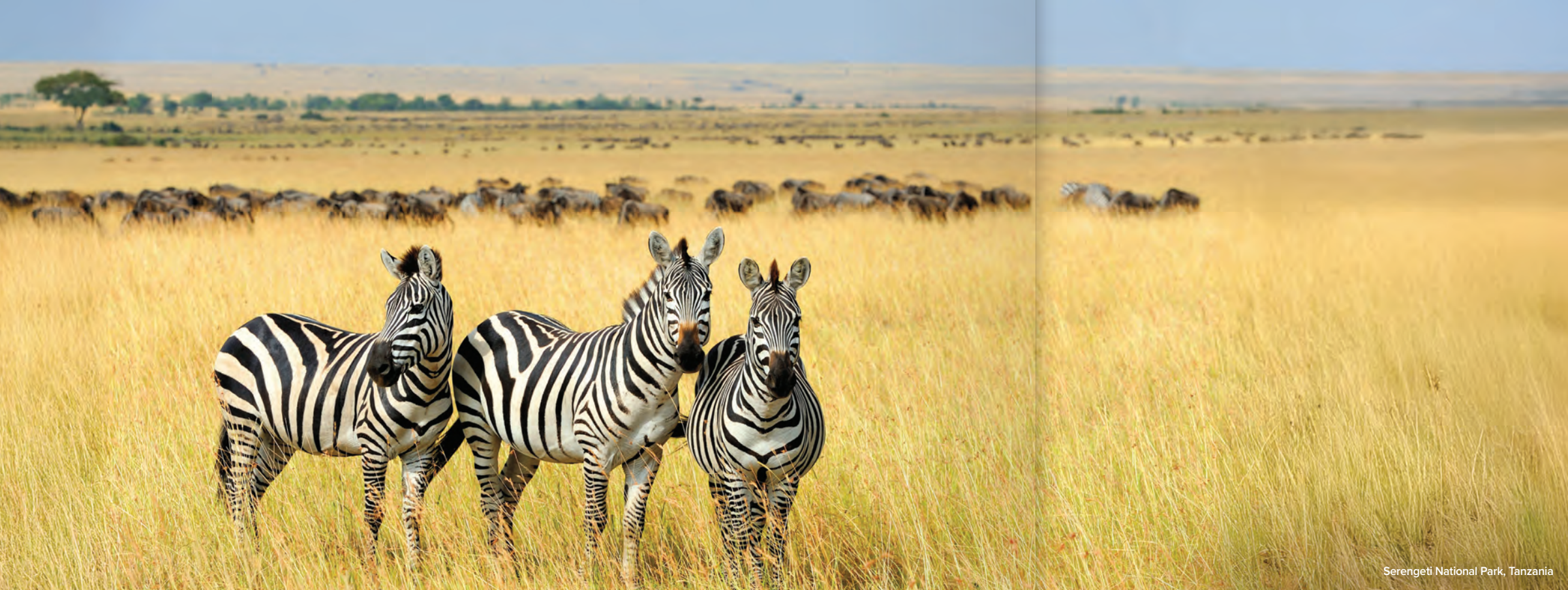
Serengeti National Park, Tanzania