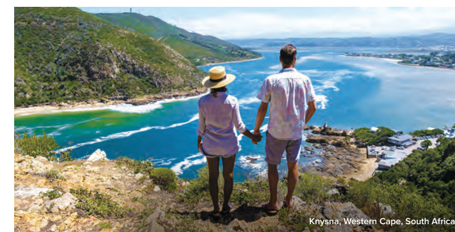
Knysna, Western Cape, South Africa