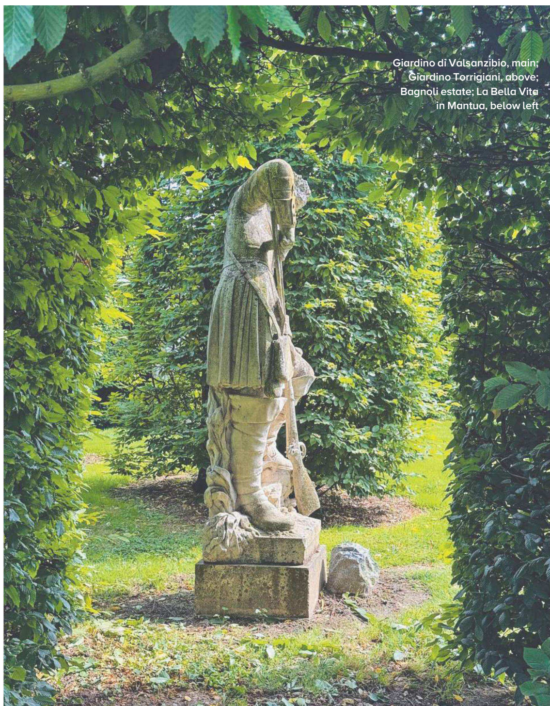
Giardino di Valsanzibio, main; Giardino Torrigiani, above; Bagnoli estate; La Bella Vita in Mantua, below left