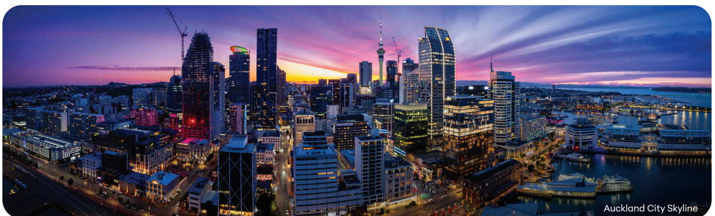
Auckland City Skyline

Wi-Fi. Please note there is limited Wi-Fi available onboard the coach. If you wish to have access on the move, please contact your service provider for details on roaming and coverage prior to departure.